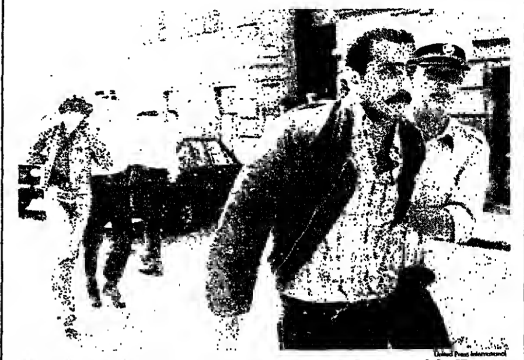
IRANIAN ELECTION VIOLENCE — Police in Vienna took away two of the 37 persons arrested Friday after about 50 Iranians attacked the Iranian Embassy...